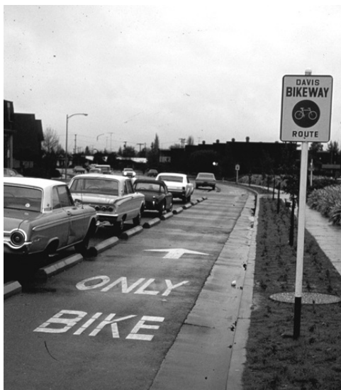
Figure 2. Amsterdam-style bike lane prototype, with one-way bike travel behind parked cars. (12)