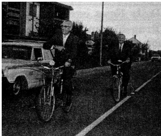
Figure 3. California Senator Marler and Assemblyman Jensen enjoy the first example of what has become the standard North American bike lane.

Eventually all lanes were converted to the now familiar configuration of the bike lane between the moving cars and parked cars, but this example is illustrative of the type of experimentation that was done to see how different configurations worked. “The city was our laboratory” professor Bob Sommer observed, and it is likely that the eventual