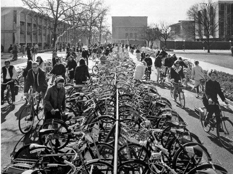
Figure 1. On campus, nearly everyone bicycled in 1966